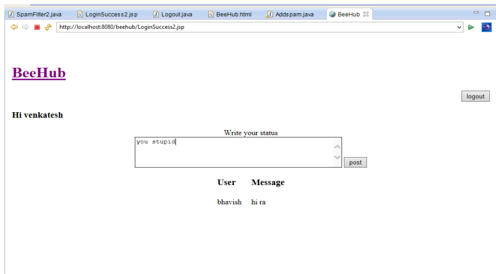
Figure: Posting a spam

After posting spam message the spam part can be replaced by "----" and not spam part can be shown as normal no replacement is needed. The result is as follows-